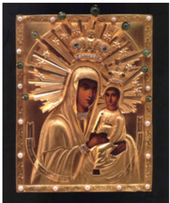
Mother of God "Pledge of Sinners" , Russia, c. 1912, tempera on wood with gold, pearls, diamonds and emeralds, Collection of Hillwood Museums and Gardens, Bequest of Marjorie Merriweather Post, 1973