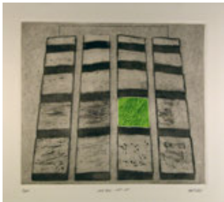
James T. Mattingly, Land Sale; Last Lot , 1971 (AP) collagraph on paper, 15.25 x 18" Collection of Boise Art Museum

Awakening: Wake Up and Smell the Coffee , 1990 acrylic on canvas 84 x 72.250" 2006.018.001