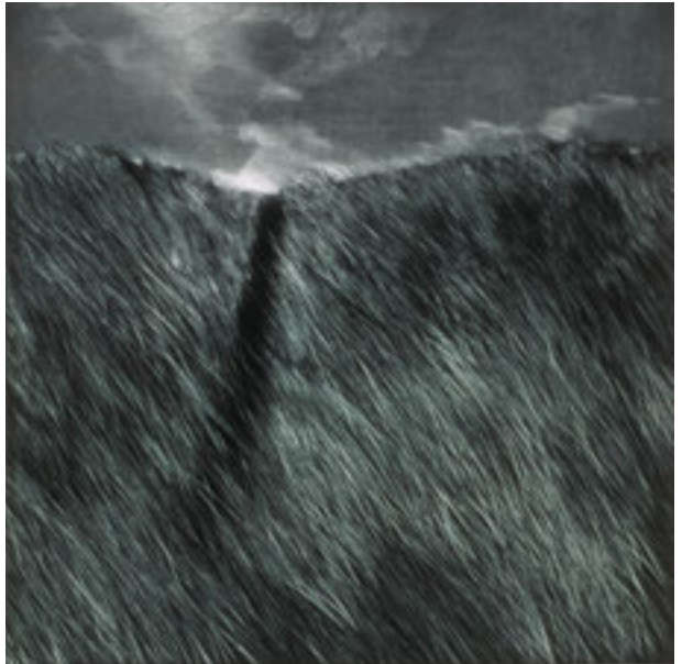
Christine Ravaux, No. 79, 1992 mezzotint and aquatint (11/15), 15.25 x 15.25" Collection of Boise Art Museum

Tonges Island, New Brunswick , 1980 gelatin silver print (9/10) 7 x 17" 2006.017.032