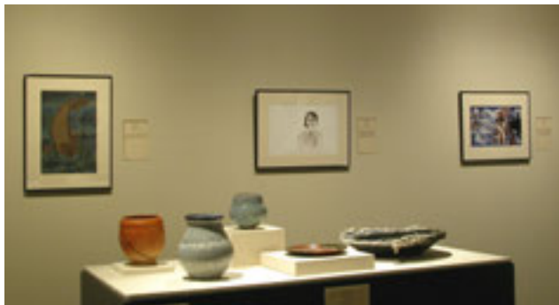
Higher Ground 2007, Installation view

BAM organized the 4th biennial Higher Ground , a juried art exhibition showcasing artwork by high school students in the Boise and Meridian school districts. This year's jurors, Boise Art