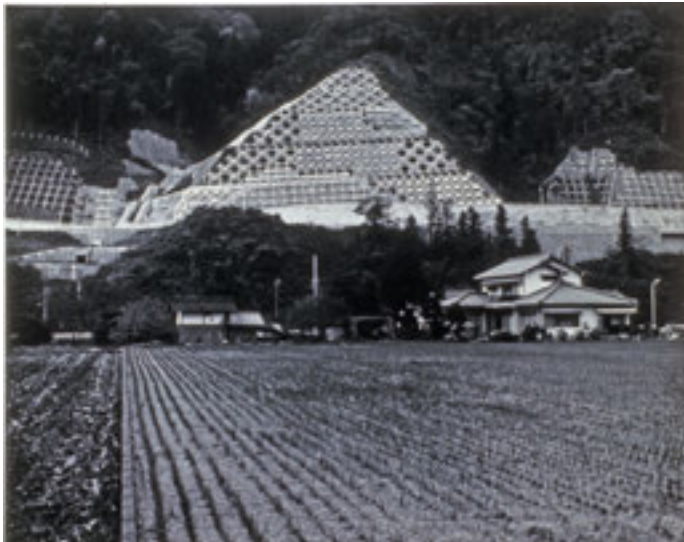
Toshiba Shibata, Yamato Village, Gifu Prefecture , 1997 gelatin print (1/25) Gift of M. Gary Bettis Collection of Boise Art Museum

Etching plate, Morgondis (Morning Haze) , 1997 copper plate 6 x 4.5" 2006.017.050