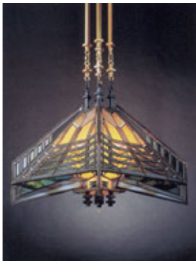
Frank Lloyd Wright, Hanging Lamp Susan Lawrence Dana House (reproduction), Original design 1902, glass and brass, Courtesy the Frank Lloyd Wright Foundation Scottsdale, AZ