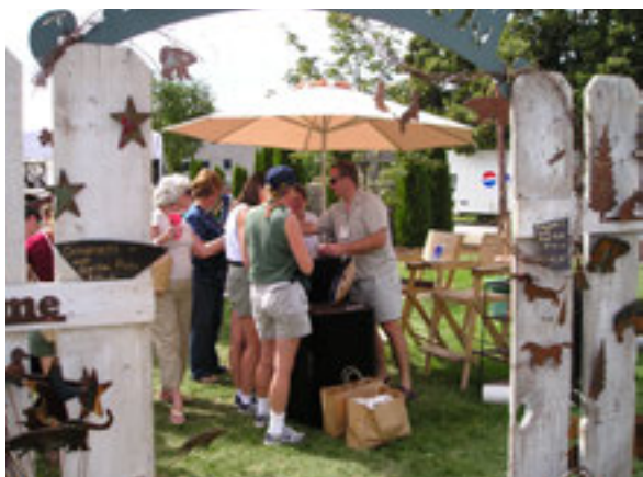
Shoppers at Art in the Park

BAM's biggest annual fundraiser, Art in the Park , held September 8, 9 & 10, 2006, celebrated 52 successful years of operation this year. Art in the Park is the largest event of its type in the region, featuring over 265 artists and 35 food vendors, and attracting 225,000 visitors from all over Idaho and the Northwest. Its popularity grows each year! New for 2006, patrons unwind with Jazz in the Garden on Saturday evening, with light fare, beverages, and performances by local musicians in the BAM Sculpture Garden.