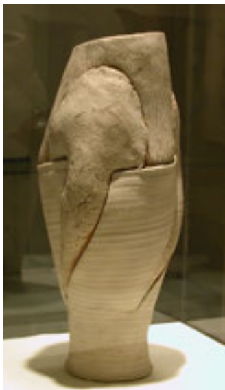
Howard Kottler Grand Twist Pot , 1965 unglazed white stoneware, 14 x 6.5 x 6" Collection of Boise Art Museum