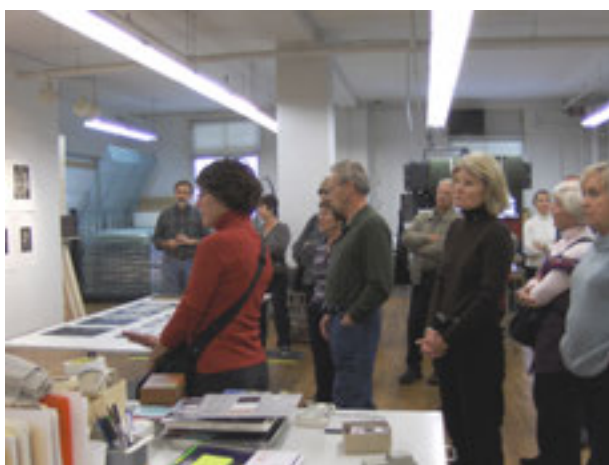
Docents at Pace Prints in New York