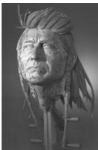
Scott Fife, Chief Joseph , 2006, archival cardboard, glue, screws, 34 x 14 x 22" Collection of Boise Art Museum Collectors Forum purchase

Scott Fife, Chief Joseph , 2006 archival cardboard, glue, screws 34" x 14" x 22"