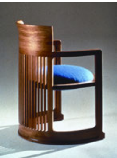
Frank Lloyd Wright, Barrel Chair, Spring Green, Wisconsin 1936, cypress (solid and plywood)