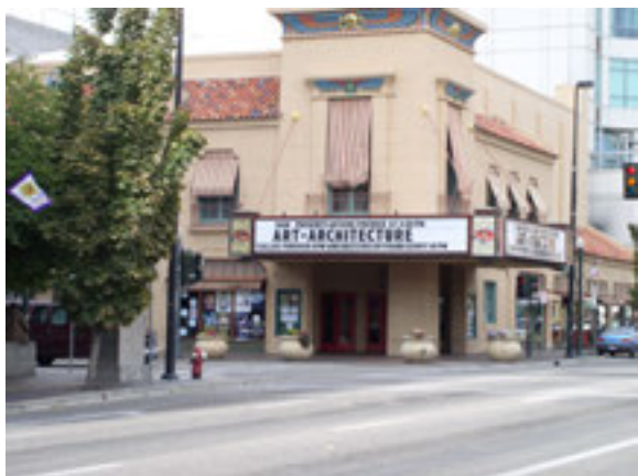
The Egyptian Theatre hosts BAM's architecture lectures

Higher Ground 2007 was sponsored by Intermountain Gas Industries Foundation, Inc.; Lutheran Good Samaritan Society, Kiwanis Club of Capital City, and the Boise Art Museum Docent Grant Fund.