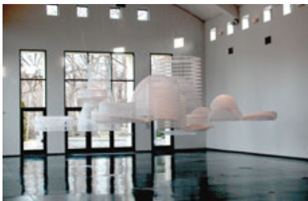
Kendall Buster, New Growth , 2007 PVC, cloth, installation view, Boise Art Museum

This exhibition celebrated the most recent gift of 80 artworks given to Boise Art Museum by local collector M. Gary Bettis, who over the last two decades has assembled one of Idaho's most significant private collections of photographs and prints. The exhibition featured mezzotints, etchings, paintings and photographs in a variety of subject matter, from still-life compositions to ethereal landscapes. In each image, the artist utilized shadow as an integral element of the composition.